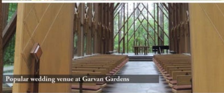
Popular wedding venue at Garvan Gardens