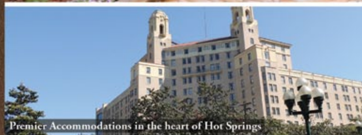
Premier Accommodations in the heart of Hot Springs