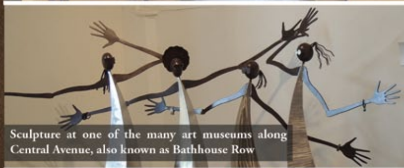
Sculpture at one of the many art museums along Central Avenue, also known as Bathhouse Row