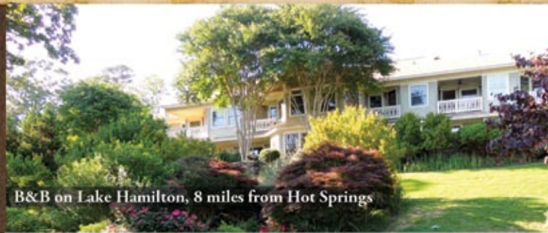
B&B on Lake Hamilton, 8 miles from Hot Springs

Another highly recommended stay would be at the Arlington Hotel, dating back to 1875, right in the center of the Hot Springs historical area. Some rather interesting characters have graced her doors to the likes of Wyatt Earp, Babe Ruth, Andrew Carnegie, and several U.S. Presidents, including Theodore Roosevelt and John F. Kennedy. Al Capone was a regular at the Arlington and always stayed in the same suite on the fourth floor, now referred to as the Al Capone Suite (Room 443). The Arlington has 203 guest rooms, valet parking, four restaurants, a Starbucks in the lobby, and of course, a complete thermal bath and spa on the 3rd floor of the hotel.