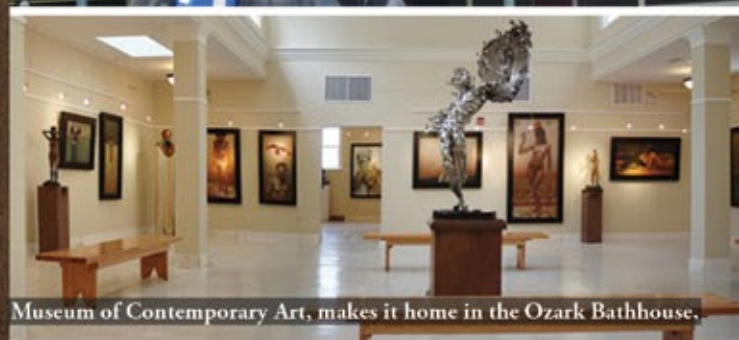
Museum of Contemporary Art, makes it home in the Ozark Bathhouse.

Hot Springs Visitor Information www.hotspings.org