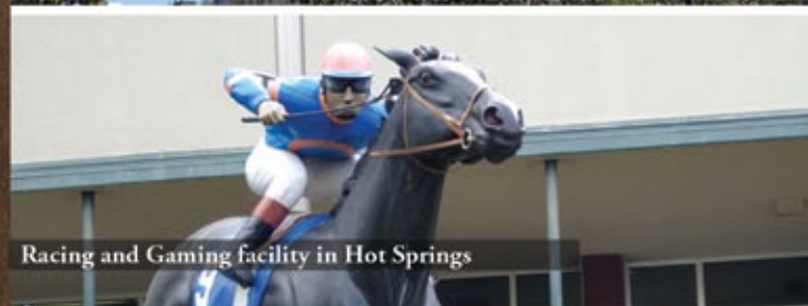
Racing and Gaming facility in Hot Springs