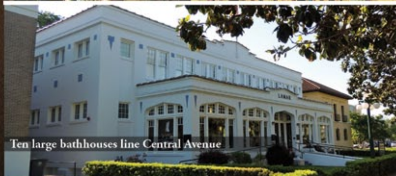
Ten large bathhouses line Central Avenue