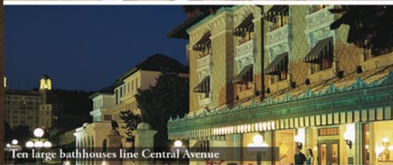
Ten large bathhouses line Central Avenue